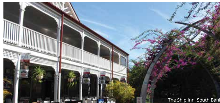
The Ship Inn, South Bank