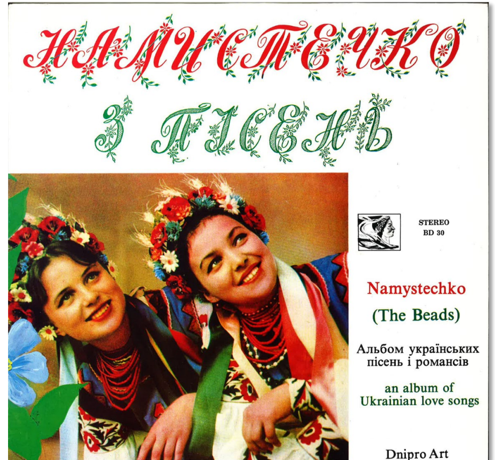
Namystechko (The Beads): an album of Ukrainian love songs Toronto, 1978