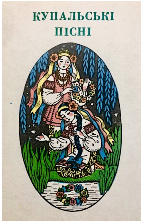
Kupal's'ki pisni, 1989