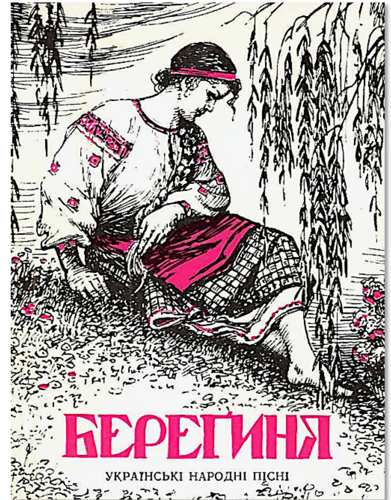
Berehynia : ukrains'ki narodni pisni, 1991