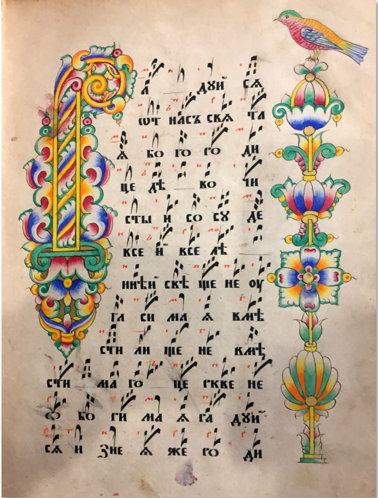
Old Believers Chant Book, 1860