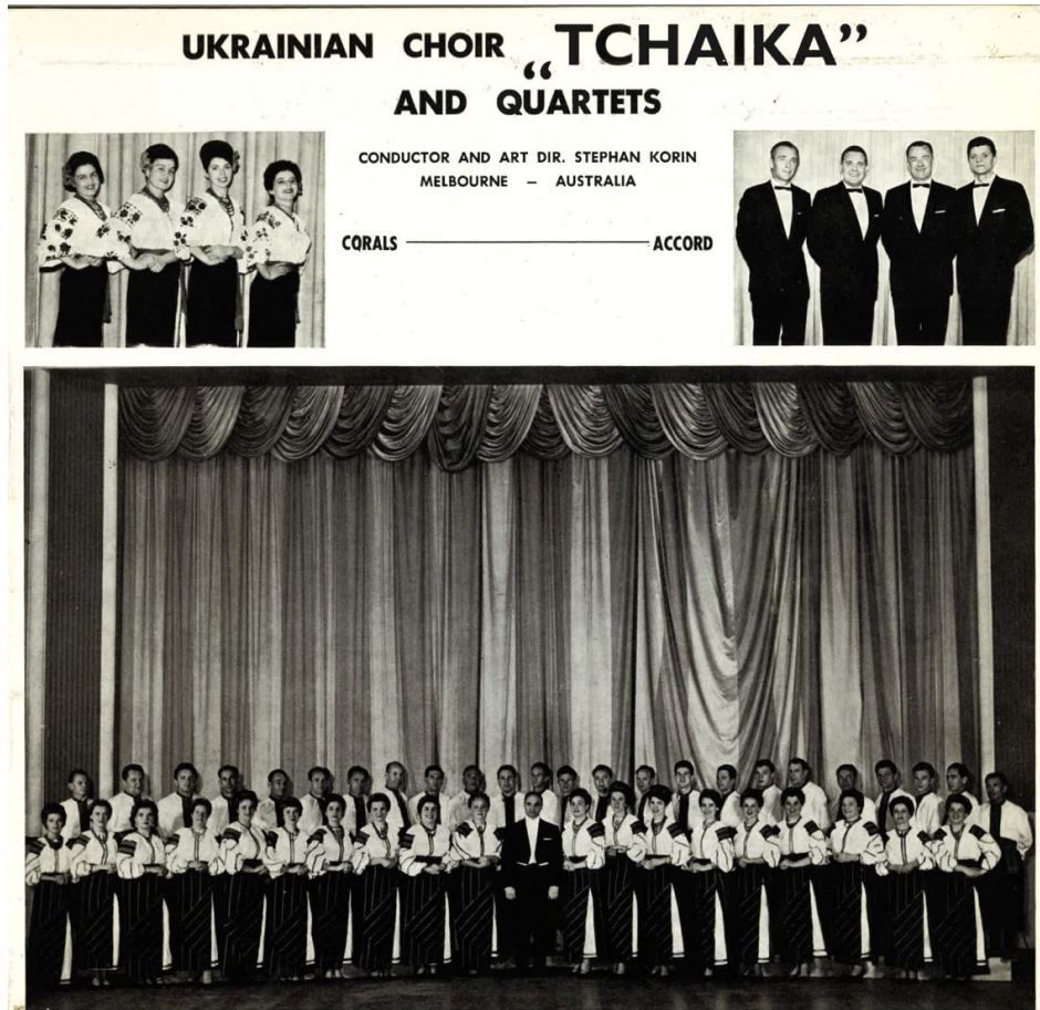
Ukrainian Choir "Tchaika" and Quartets Melbourne, 1980