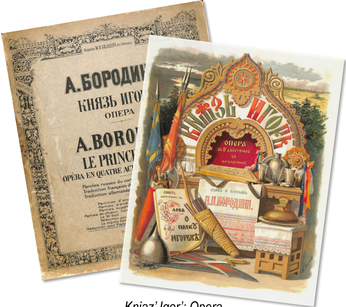
Kniaz' Igor': Opera, A. Borodin, 1888.